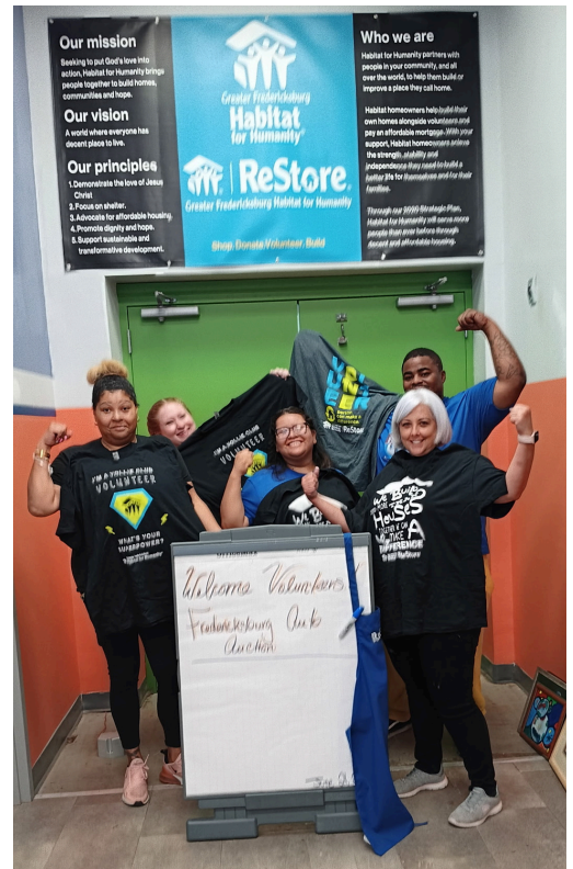
Fredericksburg Auto Auction Service Day volunteers, shown above.

Last month, the dedicated staff members of Fredericksburg Auto Auction volunteered their time at the Greater Fredericksburg Habitat for Humanity ReStore. They rolled up their sleeves to help update and refresh a section of the store, making it more inviting for shoppers. The team worked together efficiently, painting walls, organizing inventory, and creating a welcoming display area. Their efforts not only improved the store's appearance but also supported a great cause in the community. Fredericksburg Auto Auction is proud to give back and partner with local organizations like Habitat for Humanity. The staff enjoyed the teamwork and the opportunity to make a tangible difference. Customers and volunteers alike appreciated the new look and improved organization of the ReStore. This event showcased the commitment of Fredericksburg Auto Auction to community service beyond their business. It's inspiring to see local businesses actively involved in community development.